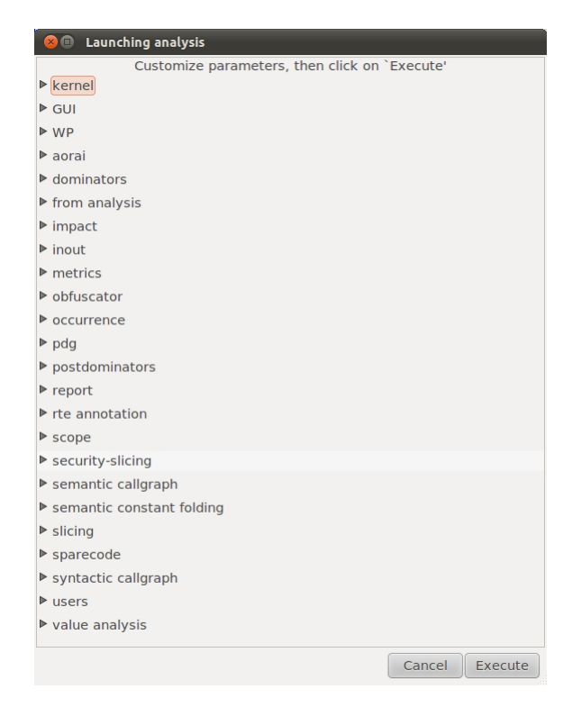
Figure 9.2: The Analysis Configuration Window

• Configure and run analyses: opens the dialog box shown in Figure 9.2, that allows setting Frama-C parameters and re-running analyses.